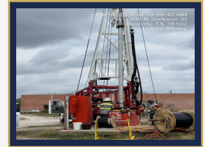
W. 1st St Well Sites