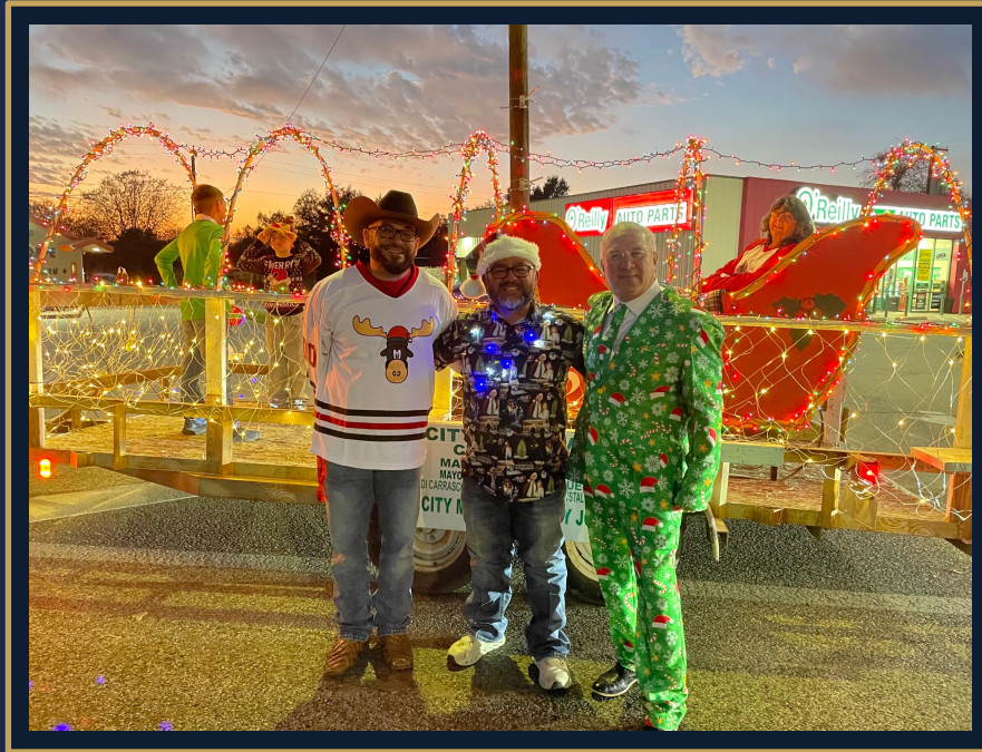
Christmas Parade — City of Beeville Float