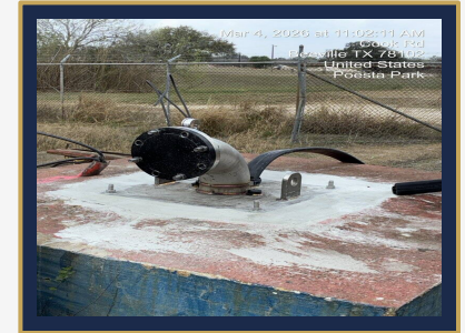
Cook Rd Well Sites