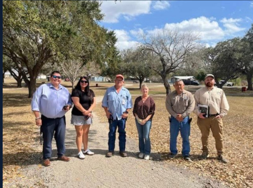
TX Parks & Wildlife Site Visit — Investing in Our Community