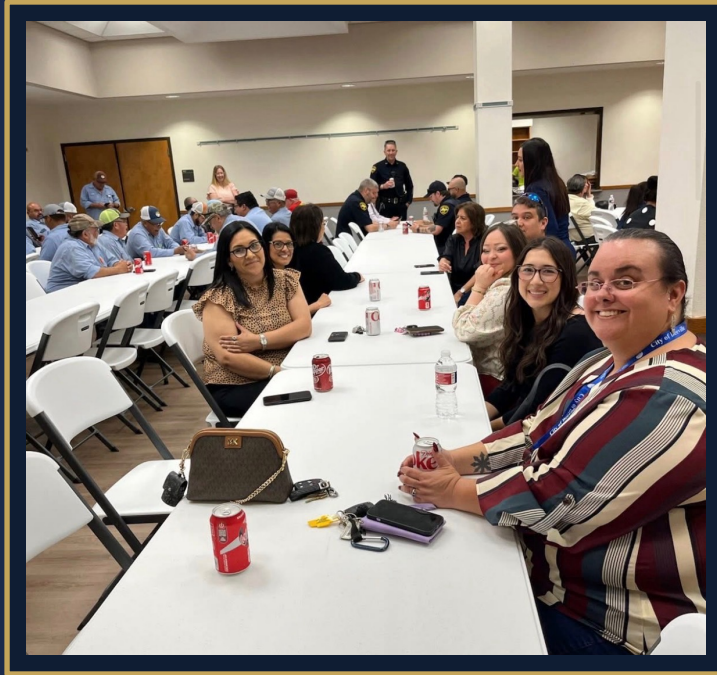
Administrative Staff — The Heart of City Operations