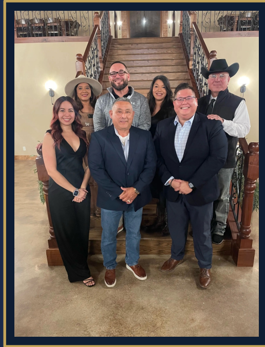
Council & Leadership — Stronger Together